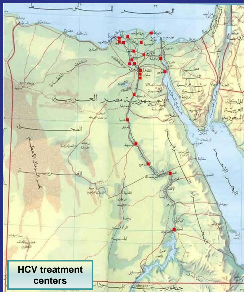
National Treatment Centers Network