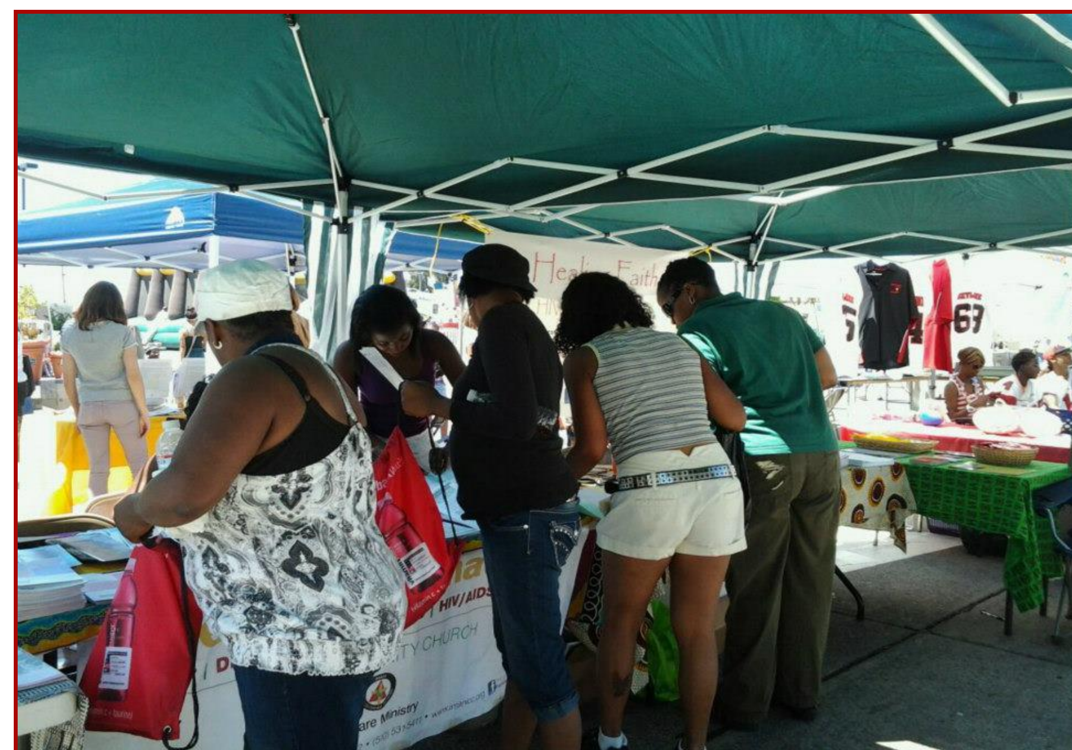
Healing Faith & Life Care Ministry Booths 13 th Annual Laurel District Street Fair Saturday, August 11, 2012

organizations, Healing Faith uses the annual National Week of Prayer for the Healing of AIDS to engage the faith community in addressing the local epidemic. Through training and advocacy programs with AVAC, the Black AIDS Institute, and the National Minority AIDS Council, Healing Faith ensures that local community members receive the most current HIV prevention and treatment information.