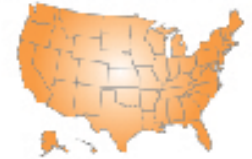
Figure. Annual age-adjusted mortality rates from hepatitis B and hepatitis C virus and HIV infections listed as causes of death in the United States between 1999 and 2007.